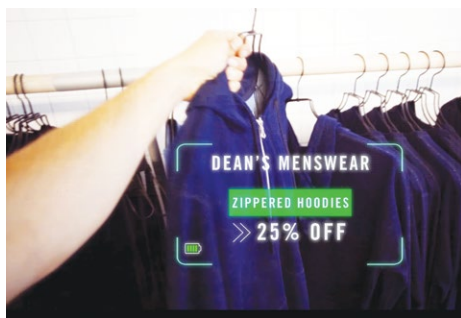
Shop for specials with location-aware access