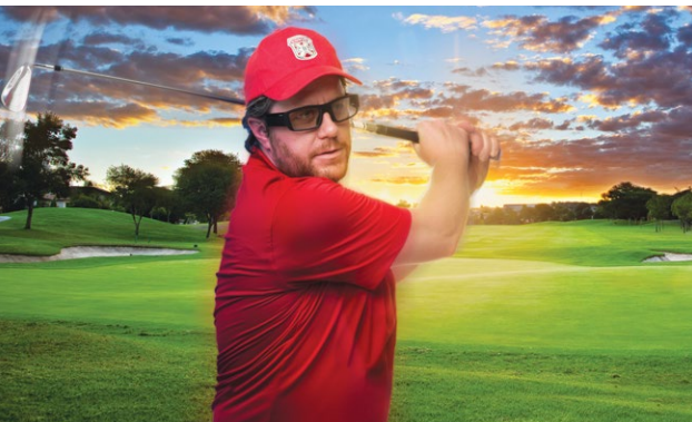
Provides mapping and distance to hole data

Perfect for any user, the Vuzix Blade delivers enhanced functionality for your on-the-go, hands-free, mobile computing requirements. Now you can stay connected and navigate without your phone in your hands. Ideal for mobile applications – from social media such as Facebook to navigation, light augmented reality, HD photography and video recording. Use the Blade to track your health levels for fitness