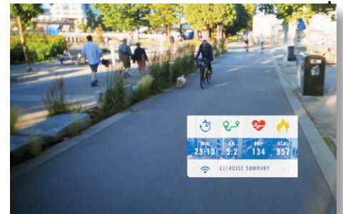
Monitor your vital signs while jogging or exercising